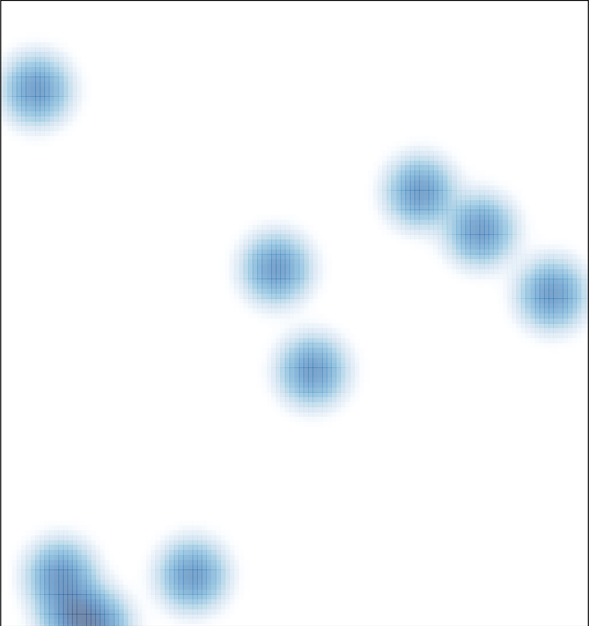
# features = 10 , max = 1